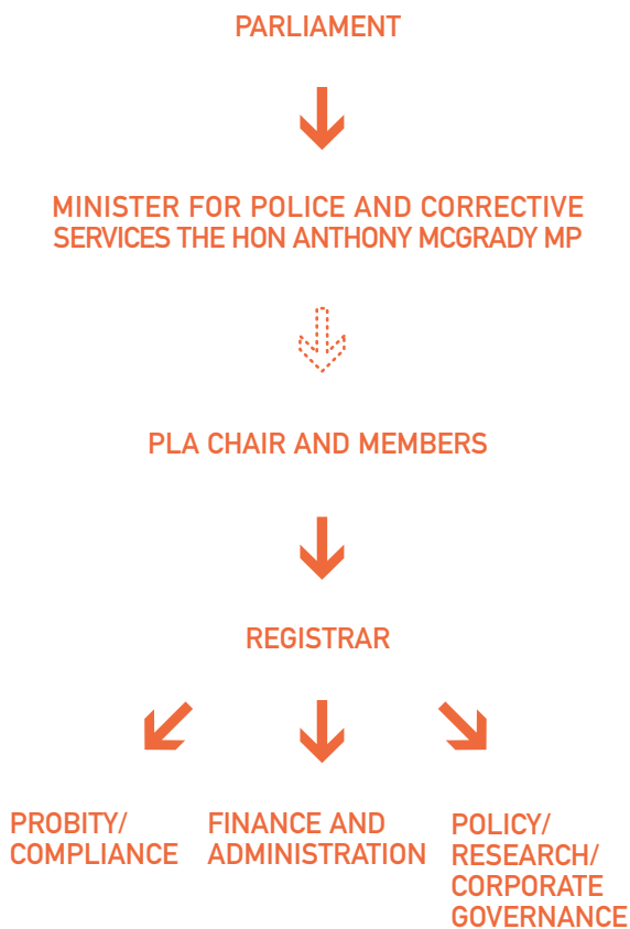
Figure 1: PLA organisational structure

We administer two non-departmental outputs: